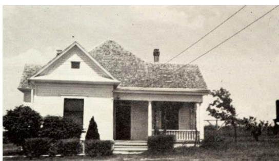
Brushy Evangelical Free Church Parsonage