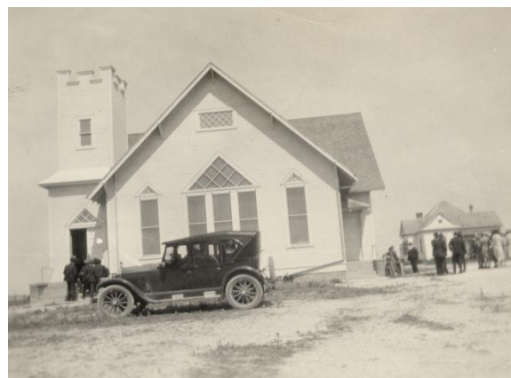
Brushy Free Church

Source: http://www.hmdb.org/marker.asp?marker=3242 Erected by: The Texas Historical Commission in 1988 Location: 1322 East University Avenue, Georgetown, Tx 78626 Williamson County