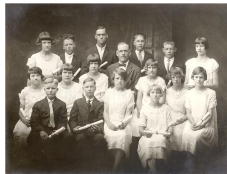
Brushy Confirmation Class